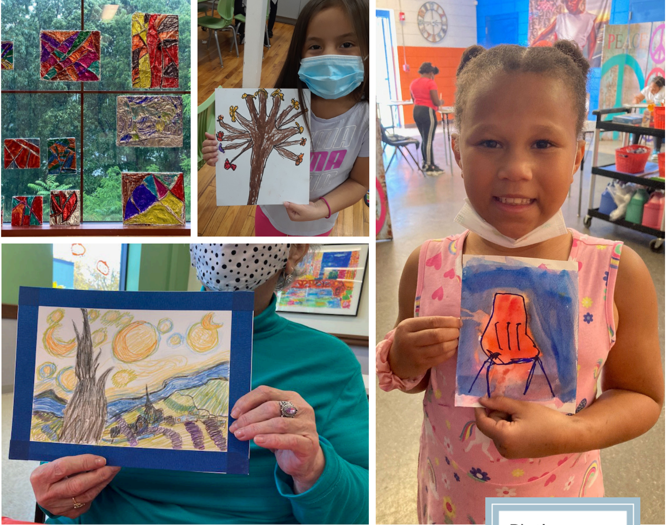
Photos from 2021 AC-RI Art Workshops include West End Community Center, Providence (top left and right), Martin Luther King Jr. Center, Newport (top center), and PACE, East Providence (lower left).