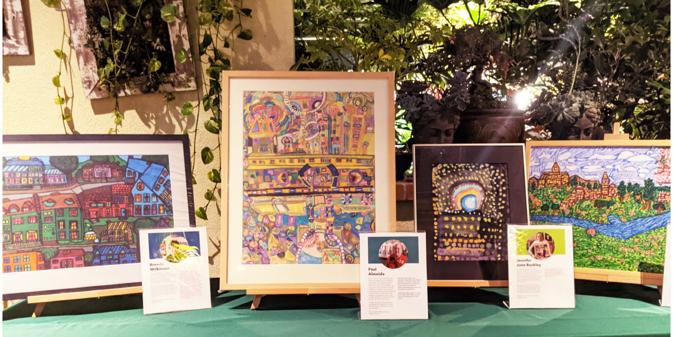
Artwork by Flying Shuttles, auctioned at the event.