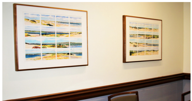
Artwork donated by AC-RI, hanging in the new East Providence PACE headquarters.